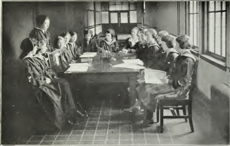
CABINET OF YOUNG WOMEN'S CHRISTIAN ASSOCIATION IN SESSION

"That young women may grow in Christian strength and increase in efficiency in Christian work."